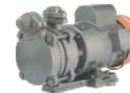
CBR SELF PRIMING PUMPS 1440 RPM SPDP MOTOR