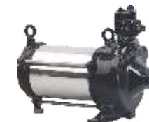
KOS N Openwell Submersible Pumps