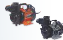
JALRAAJ PUMPS SERIES