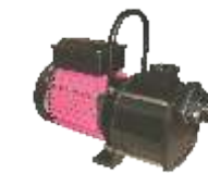
NEW LIFTER SERIES PUMP