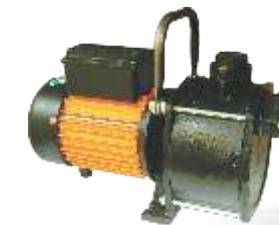
KSW SHALLOW WELL PUMPS