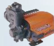
KIRLOSKAR MINI PUMP