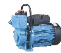
MEGA 54S Single Phase Monobloc Pumps