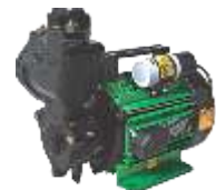
KIRLOSKAR STAR SELF PRIMING