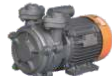
CMS SELF PRIMING PUMPS 1440 RPM SERIES