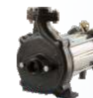
CHOS Pump CBE Open Well Pump