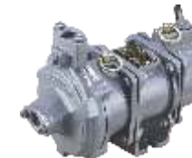
KOS M Openwell Submersible Pumps