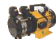
NEW AQUA SERIES